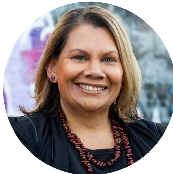
SENATOR DORINDA COX

President, WA Local Government Association, Shire President, Morawa